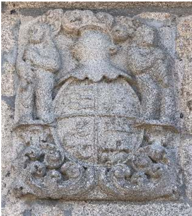
Quartered coat of arms on the north wall of the house.